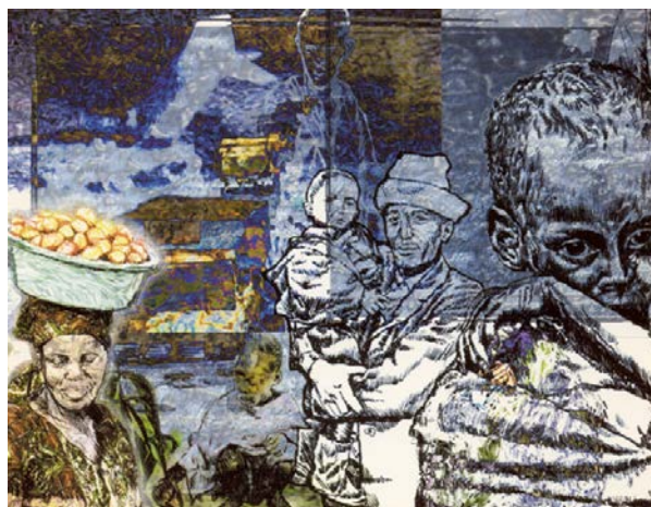
Figure 1: Challenge of learning and action in a disaster and development nexus