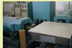
3D Vibration Table