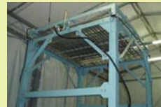
Artificial Rainfall Machine