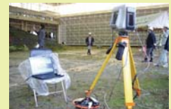
3D Laser Scanner