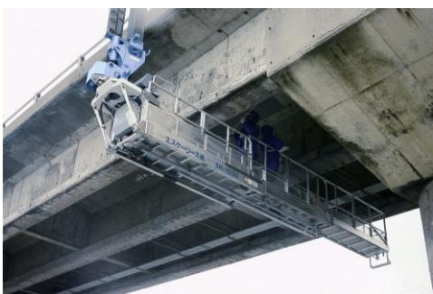
Maintenance of concrete structure such as bridge, building etc.