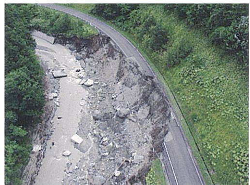
Damage to the Atsubetsugawa River Basin caused by Typhoon No. 10