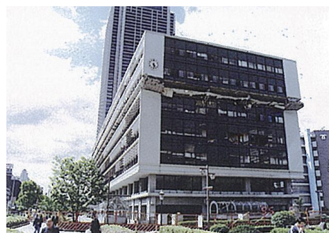
Intermediate layer destruction by the Great Hanshin-Awaji Earthquake