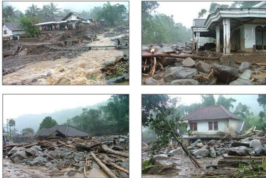
Figure 1 - The Damages Due to Flashflood in the Lower of Konto River in 2006

The roadmap contains sediment management plan activities in each reservoir and its catchment area which includes: 1) catchment management plan (vegetative conservation and structural measures, 2) river channel management plan (sabo dam construction and rehabilitation), 3) reservoir sedimentation management (sediment dredging and flushing), and 4) monitoring and evaluation plan.