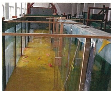
Figure 2. Floating mechanism