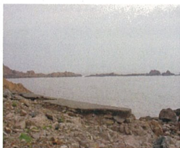
Figure 1. Breakwater failure

There are many research activities currently on-going in the KLCDD. For example, field studies are carried out for the failure investigation of coastal breakwaters along the China Coast (Figure 1). Laboratory experiments are conducted to understand the interaction mechanism of floating objectives in the case of large waves (Figure 2). Numerical methods are developed for wave spectra assimilation in typhoon wave modeling for the East China Sea (Figure 3).